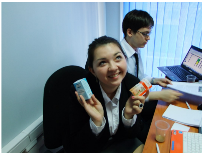
Dopping for Chairs to become true nyashkas