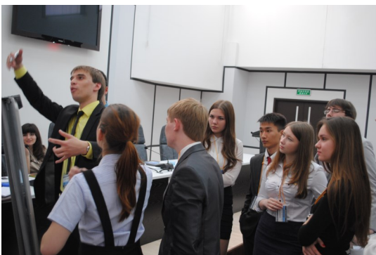
South Korea delegate of GA 6 is practicing ballet dance