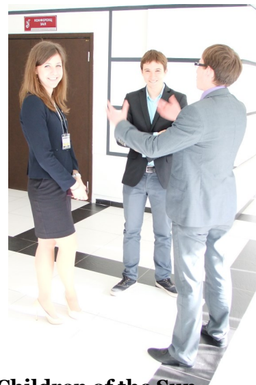
Children of the Sun