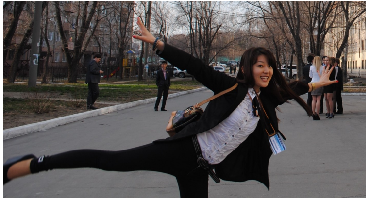
I can fly!