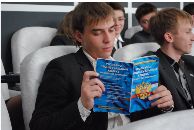
The rule of law