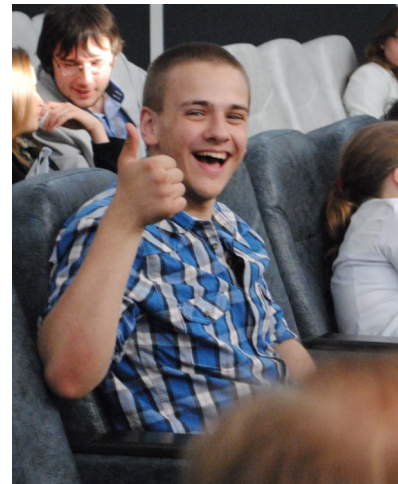
I feel good