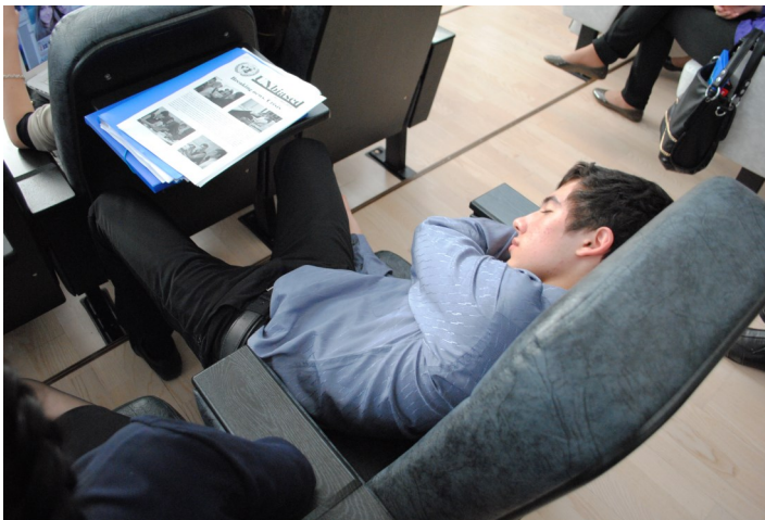
Tired. Just tired